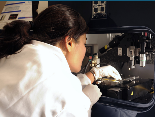
Getting a specimen ready for the Nano Indenter Atomic Force Microscope.